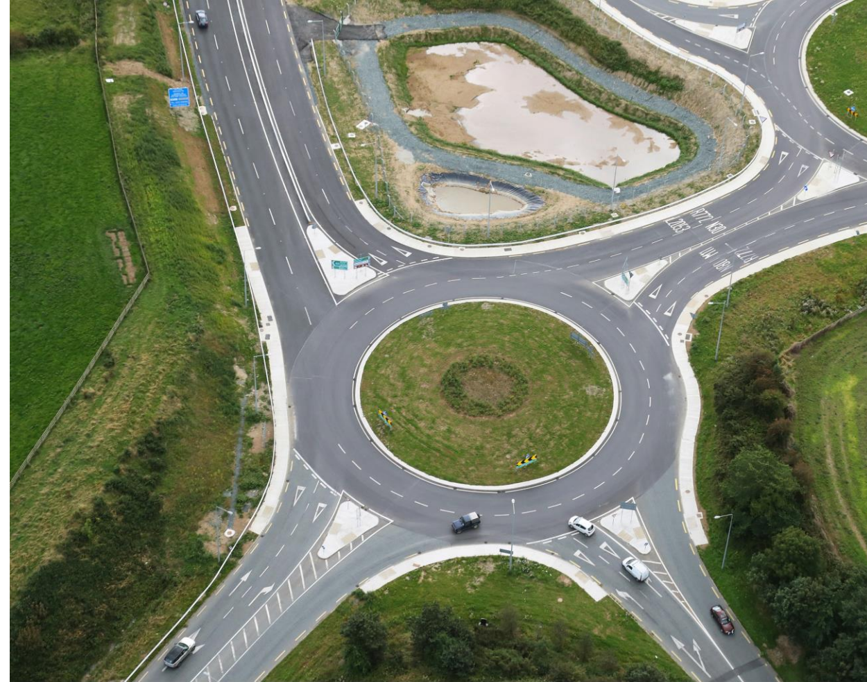
Date: 5th September 2019